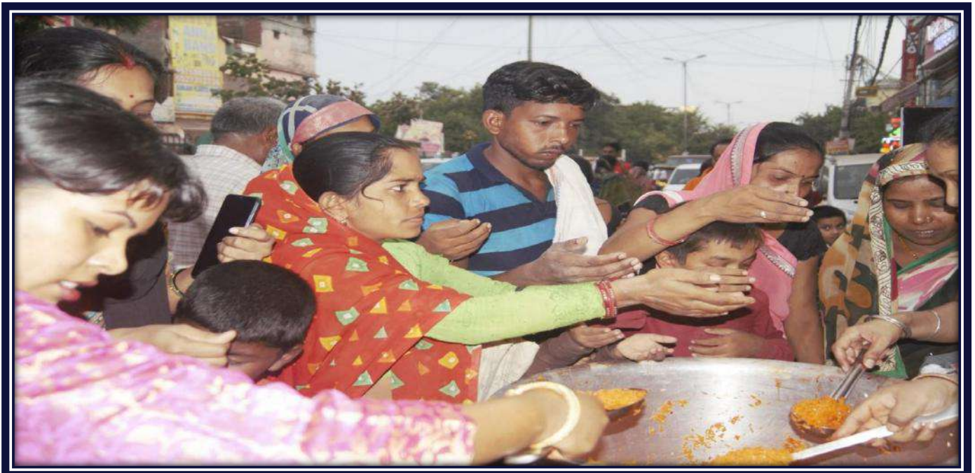
Bhandara, Chhatarpur, 2023

In the year 2023, on the 28 th of June, the Koshish Team celebrated the Mango Festival with a lavish lunch, thandaai and best-quality mangoes.