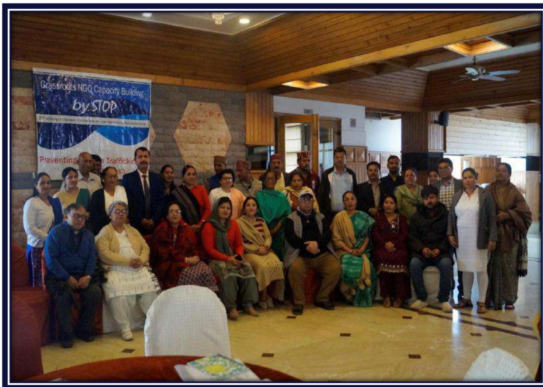
Himachal Pradesh, 2023

III. STOP launched the first ever report concerning the sexual exploitation of boys along with ECPAT International. A meeting was organized on the 25 th of April, 2023, to launch the study meeting of “Global Boys Initiative: Sexual Exploitation of Boys: India Report”, at Hotel Holiday Inn, Aerocity. The event focused on introducing the study, involved the panellists to shed light on the topic from various viewpoints, and creation of an Action Plan prepared through recommendations given by the participants as well as the panellists.