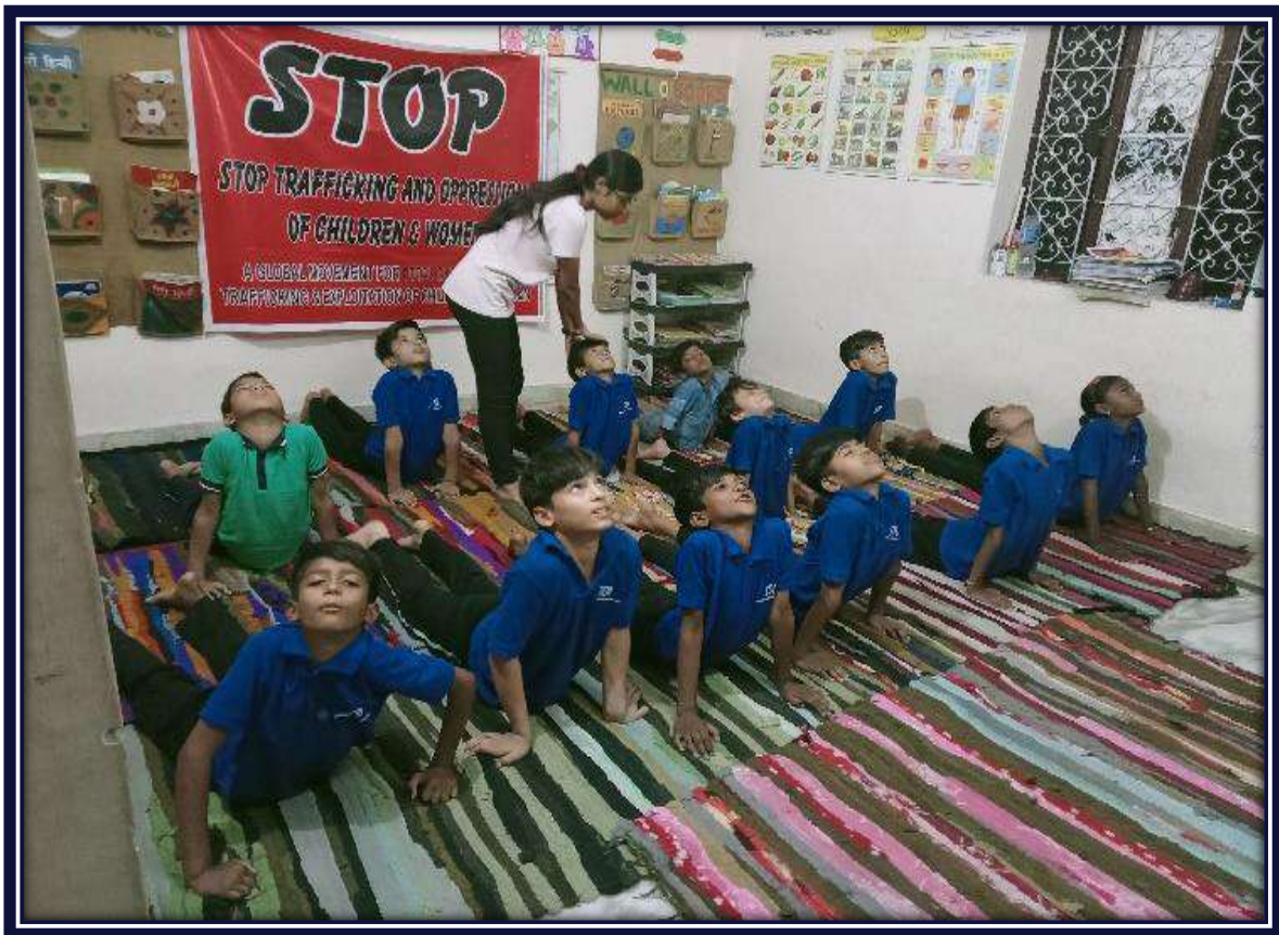
Tigri, International Yoga Day, May 2023