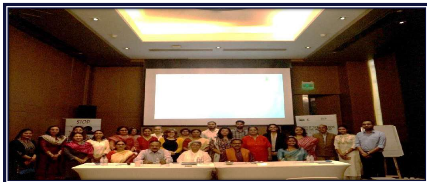
ECPAT and STOP, Meet on Sexual Exploitation of Boys, 2023

III. STOP launched the first ever report concerning the sexual exploitation of boys along with ECPAT International. A meeting was organized on the 25 th of April, 2023, to launch the study meeting of “Global Boys Initiative: Sexual Exploitation of Boys: India Report”, at Hotel Holiday Inn, Aerocity. The event focused on introducing the study, involved the panellists to shed light on the topic from various viewpoints, and creation of an Action Plan prepared through recommendations given by the participants as well as the panellists.