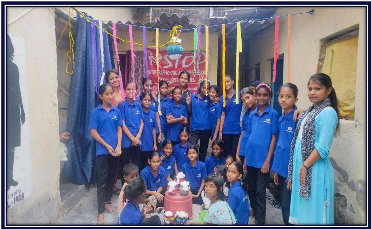
Tughlakabad, Janmashtami, September, 2023