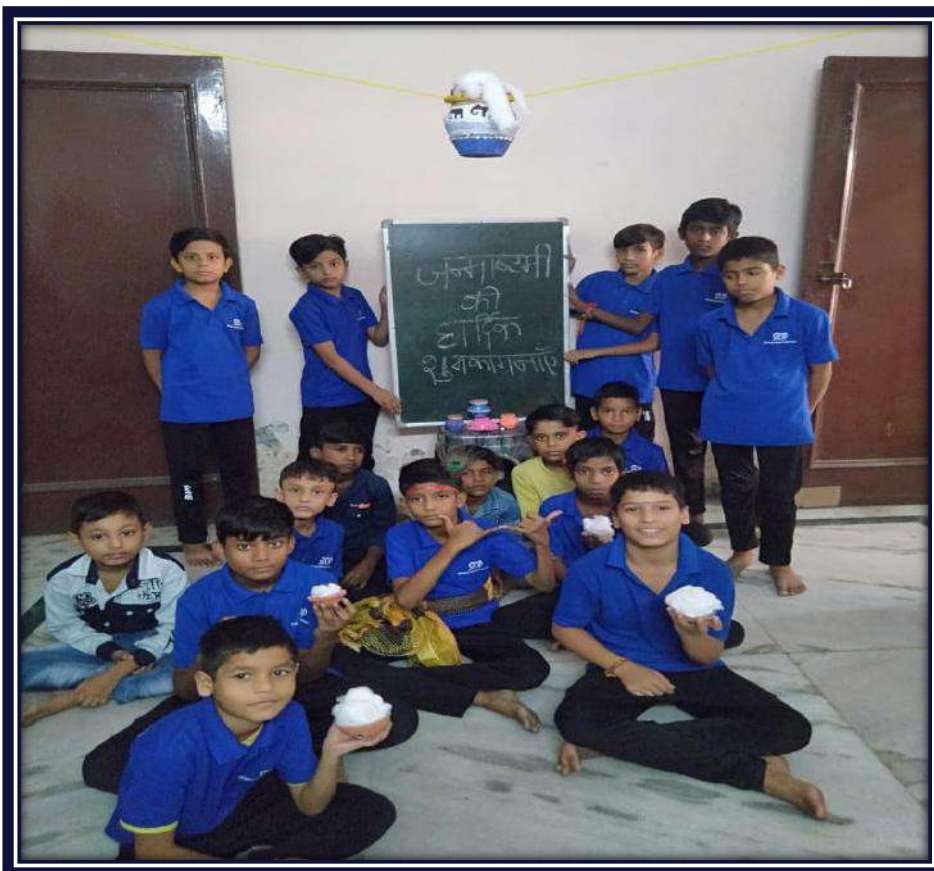
Tigri, Janmashtami, September, 2023