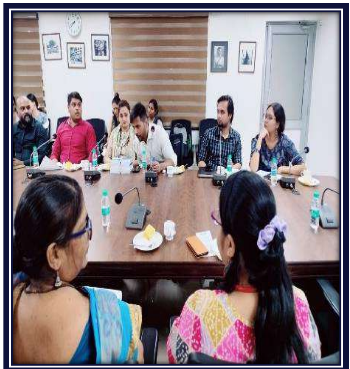
SPUWAC (Special Police Unit for Women And Children) Meeting, 2023

STOP and ECPAT International collaborated on an intensive research on the topic of sexual exploitation of boys in India, which was a part of the wider research conducted at a global level. This culminated into a two day long summit arranged from the 6 th to 8 th of June, in Casablanca, Morocco. One of our representatives was invited to participate and represent our country. Our input was reflected quite deeply in the research, and key challenges to boy's exploitation being much the same worldwide received a big nod from the audience.