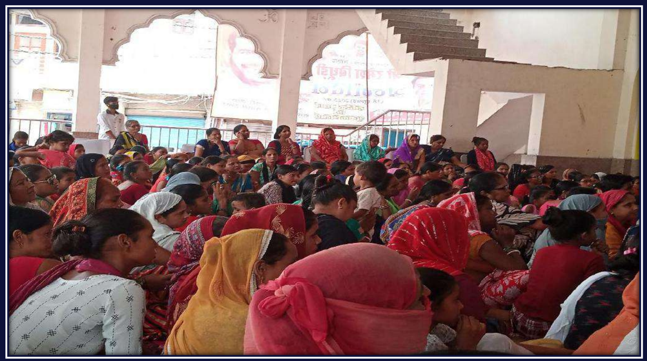
Workshop on Prevention Against Human Trafficking, Tughlakabad, 28 th July, 2023