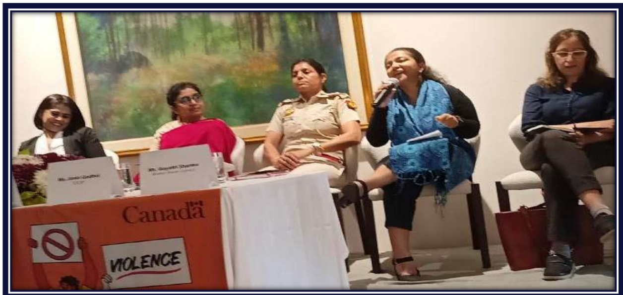
Panel Discussions on Gender-Based Violence, 2023

STOP had been invited to be a part of the Panel Discussions on Gender-Based Violence scheduled on Thursday, 16 th of March, 2023. The talks included the resources each could provide, from giving courage, medico-legal aid and counselling, to filing a FIR and fighting in the court, remotely as well as physically. They especially focused on foreign nationals as victims and the international and national laws pertaining to giving them justice in the Indian courts. It included questions revolving around the victim's consent to conduct an invasive medical examination, as well as how to deal with each specific case, using an ideal mix of non-verbal gestures and friendly verbal communication, at psychological, physical, medical, legal levels, with constant assistance from civil bodies like STOP .