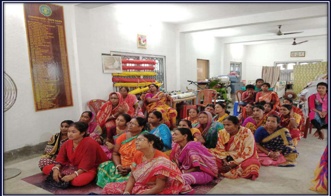
South 24 Parganas, Sunderbans, West Bengal, 2023