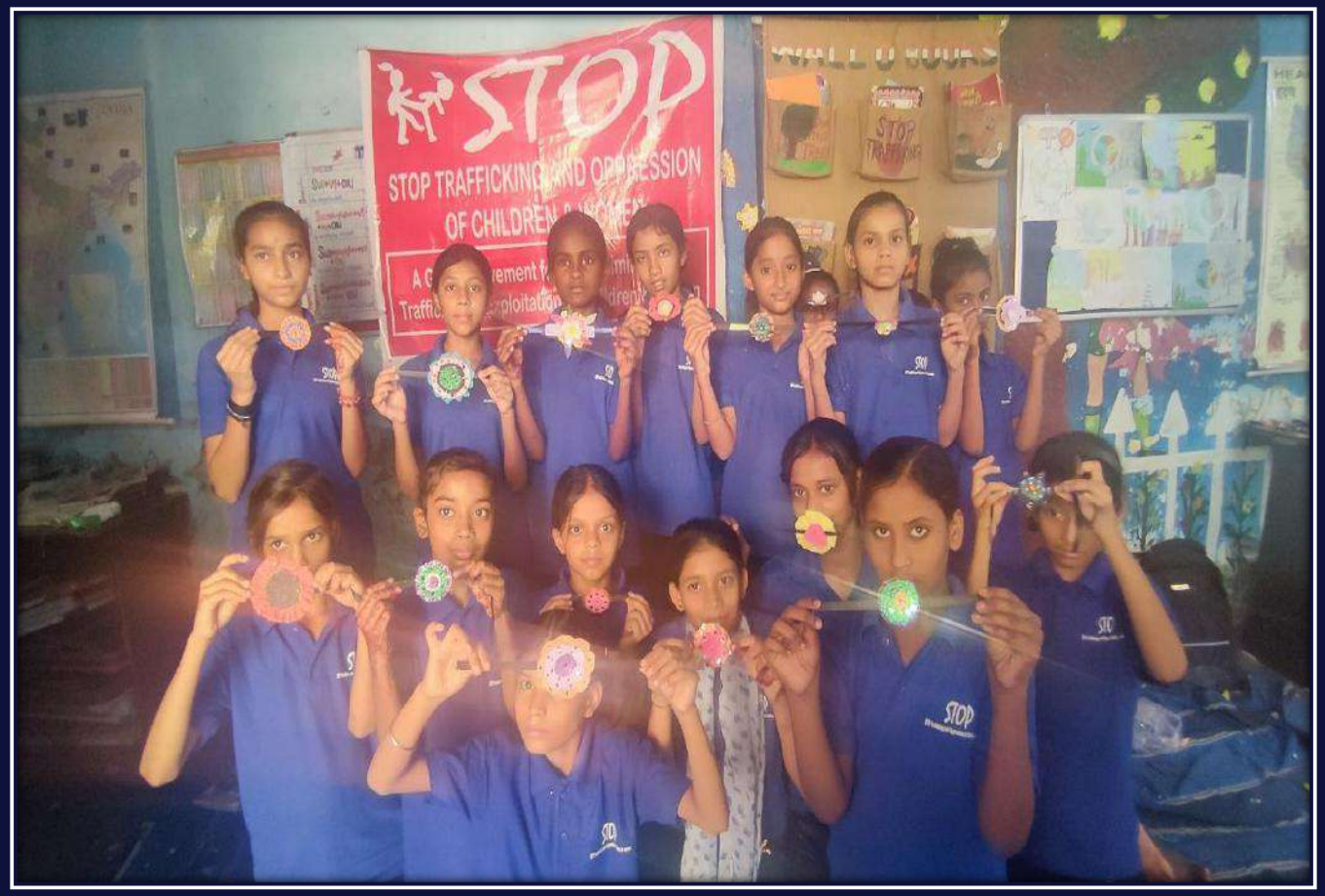
Tughlakabad, Raksha Bandhan, August 2023